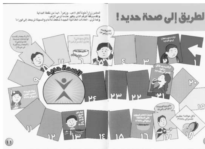
Game from the preparatory student booklet. The objective is to achieve iron health.