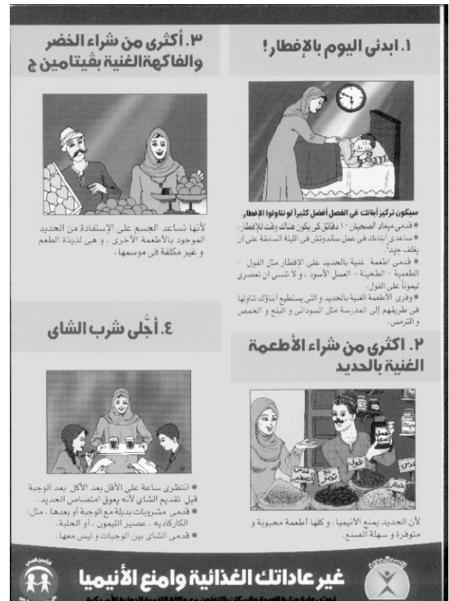
Pamphlet for mothers—promoting behaviors that prevent anemia.

Four posters (one set for preparatory and one set for secondary classes) were created to promote the key dietary practices. In addition, one poster promotes the iron supplementation program and pictures the students, teachers, and parents who appear in the television spot. The posters are popular because they are brightly colored and help to decorate the classrooms. Posters placed in the classroom change during the health education campaign to coincide with the message focus of the activities. Tablet distributors convey brief nutrition messages during the weekly distribution of tablets, reinforcing the four behaviors.