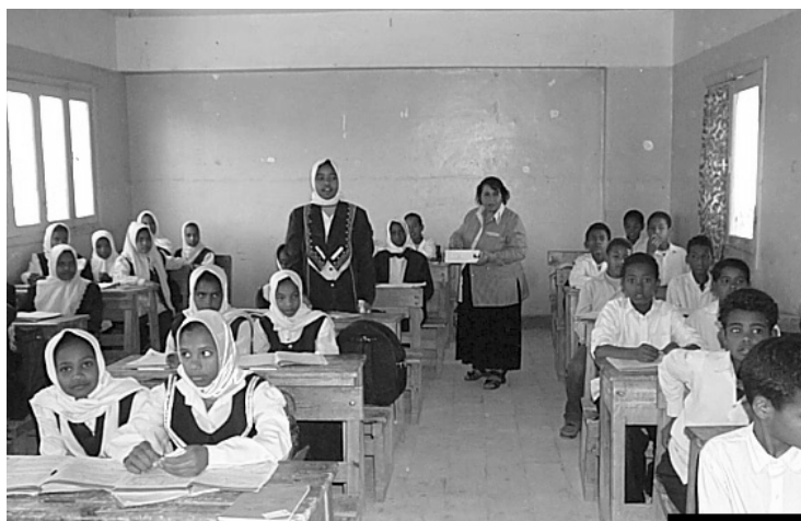
Iron tablet distribution in a secondary school.

The program has been implemented in phases. It began with formative research and an operational research study, expanding next to a one governorate trial and finally to implementation in five governorates. This phasing ensured that the methods for supplementation and nutrition education were tested, logistical problems solved, and cultural issues resolved to ensure success and sustainability.