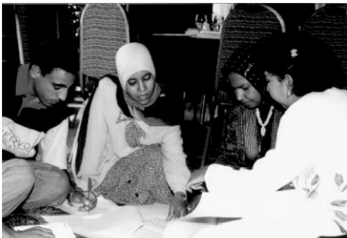
Health educators doing a group activity during training.

The reporting and data handling at the SHIP governorate-level office was enhanced by the purchase of a computer and training of two staff in three major software programs. Additional training in EPI Info data entry and simple analyses is planned.