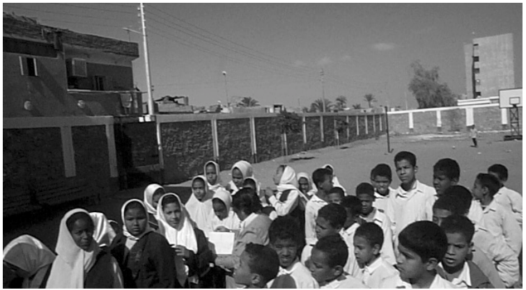
Preparatory children at school.

Thirteen million people, 22% of the Egyptian population are currently adolescents. 3 The government is