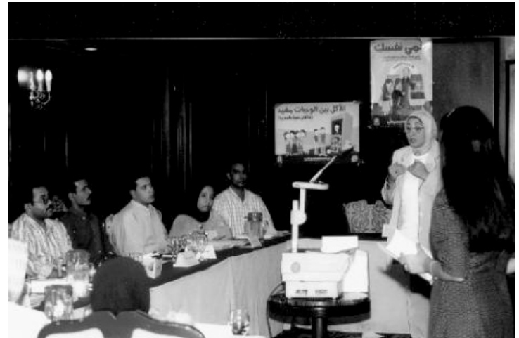
Training session for nutrition educators.

Based on these findings, and information from other governorates that HIO staff numbers would be a constraint, project staff were concerned about the ability to adequately sustain the iron supplement distribution. This led to development of a trial in Beni Suef governorate in 2001 with teachers distributing iron tablets to students. Over 5,300 teachers in 322 schools have been trained to distribute tablets and keep records. The MOE has agreed to implement tablet distribution under the supervision of SHIP.