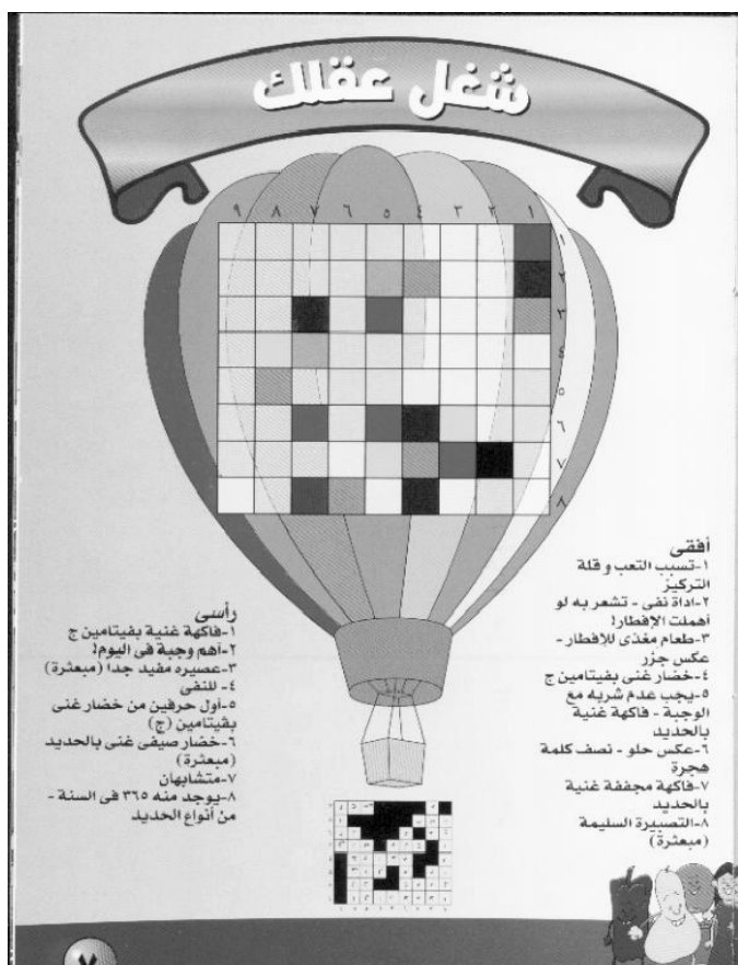
Crossword puzzle from the booklet for secondary students. Hints are based on iron and anemia facts.

For schools with more than four classes per target grade, the nutrition and health educators conduct a campaign in the school for three weeks. Smaller schools have a campaign conducted during a reduced time period of 1 1/2—2 weeks. The campaign progresses through each of the four behaviors as specified in the Nutrition and Health Educator's guide. The educators select activities from forty-five choices. The educators conduct activities in classes of absent teachers,